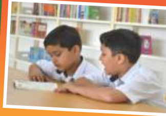
Reading / Learning