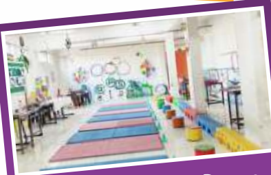
Kid's Activity Room