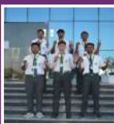
Cricket District Winners