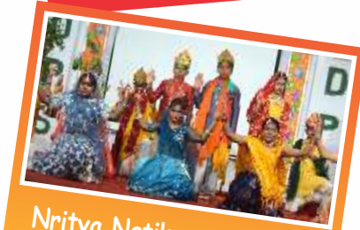
Nritya Natika competition